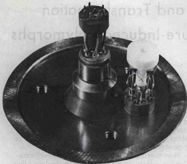
Fig. 1—Specimen holder and bottom closure for hydrostatic pressure system.

high-purity single-crystalline stock having the following detectable impurity levels: